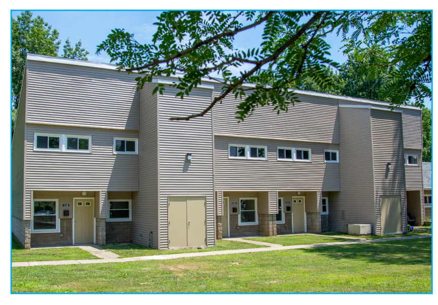
Pictured above, SHA's Riverside Apartments Building #4 after recent reconstruction completion.

Now the four, 4-bedroom apartments are complete and are ready for new residents. The apartments feature new efficient energy systems with electric appliances and heating systems.