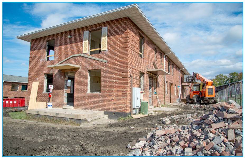
Above, interior demolition underway at SHA's Valley View Terrace buildings #'s 13 and 14, pictured is building #13

Comprehensive Overhaul of Site Continues with Buildings 13 and 14