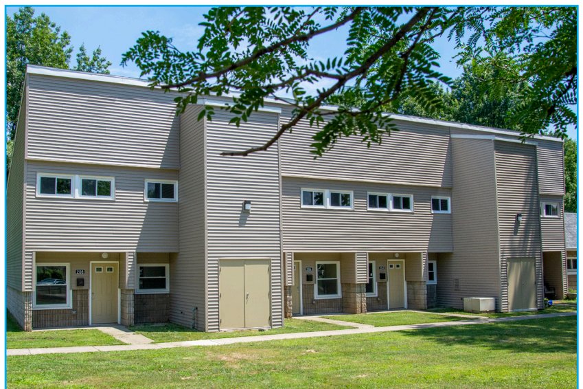
Pictured above, SHA's Riverside Apartments Building #4 after recent reconstruction completion.

Now the four, 4-bedroom apartments are complete and are ready for new residents. The apartments feature new efficient energy systems with electric appliances and heating systems.