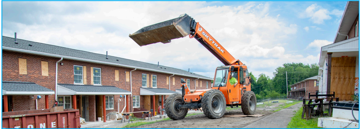
Pictured above, current construction at SHA's Valley View Terrace, and below left, new security system components at SHA's Washington West complex.

The Scranton Housing Authority received $3.97 million of this grant funding. Part of these funds will be used for general construction in buildings 13 and 14 at Valley View Terrace.