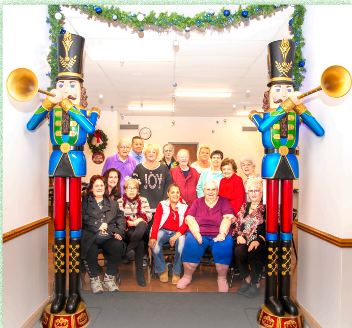
Pictured above, some of the residents and staff at Jackson Heights High Rise gather under the Christmas soldiers