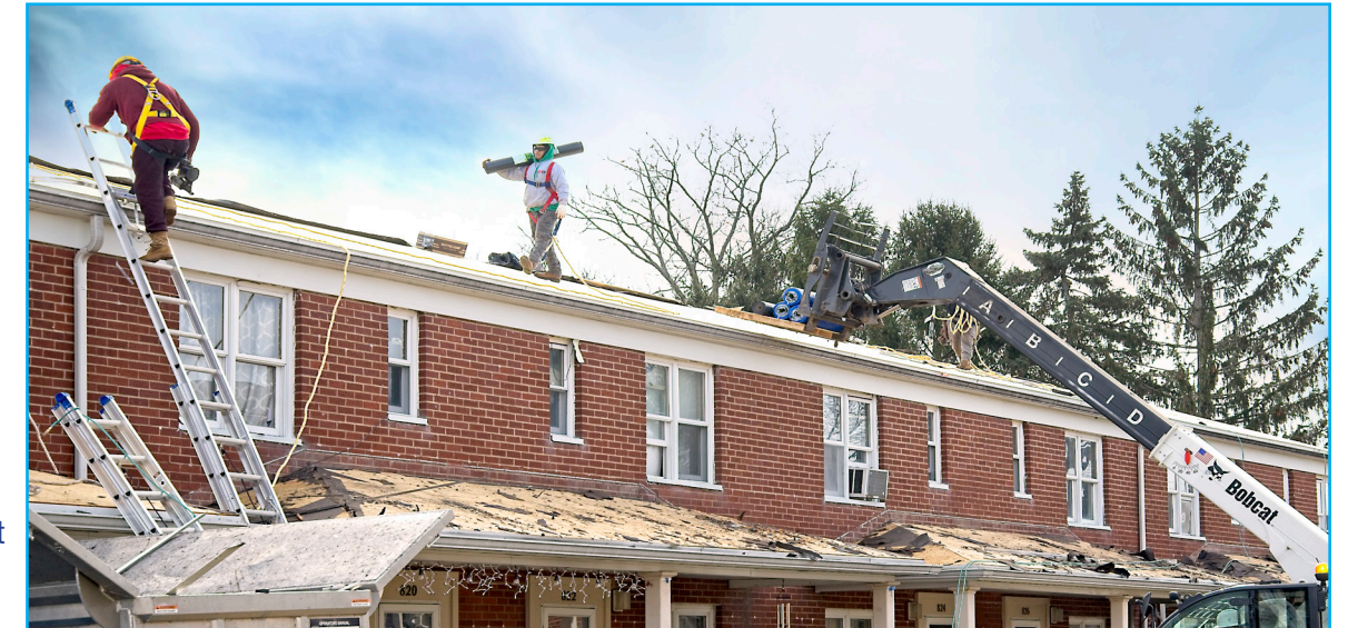
Above, crews scale the roofs at SHA's Hilltop Apartments as part of the multi-site capital improvements projects initiative currently underway.

Riverside Apartments, Jackson Terrace Apartments and Hilltop Manor Apartments are part of an initiative to address many improvements throughout the properties.