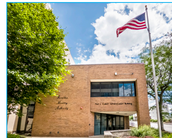
Above, SHA Administration Building in Scranton

Review of Program Performance Produces Perfect Score