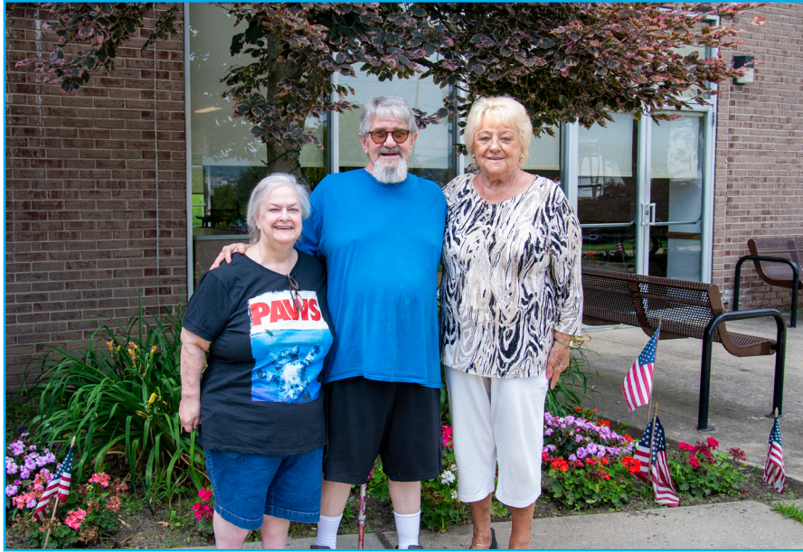
Pictured above, residents at Jackson Heights beat the heat under some of the shade trees at the property's front gardens.

With a hotter than normal summer it is important to find ways to beat the heat and avoid potential harmful health effects of the heat and sun.